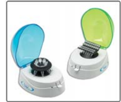
Includes Both Rotors