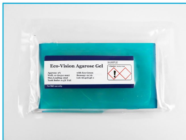
TAE12-2PER-SF: Precast Agarose Gel TAE, 2%, 12 Well, Eco-Green Stained