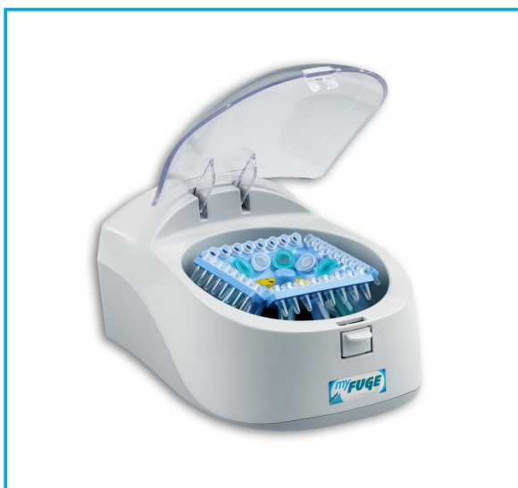
BCM1746 - MyFuge 12 Micro Centrifuge

Catalog #: BCM1746 Size: 1 UNIT Storage: 18-25°C